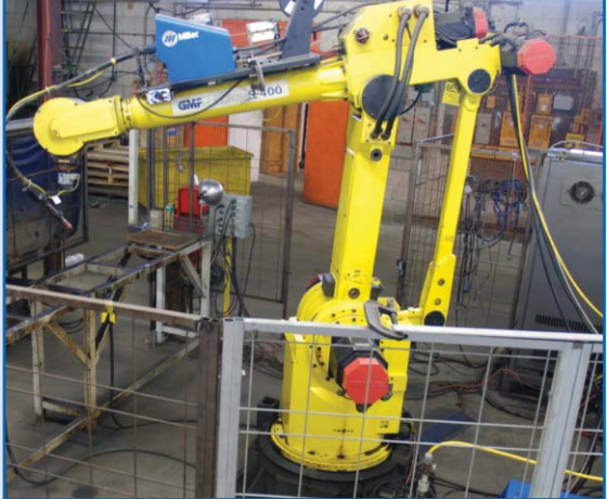
GMF S-400 6 AXIS ROBOTIC CELL, INCLUDING: MILLER MAXTRON 450 WELDER (#7)