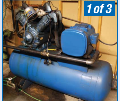
25 HP AIR COMPRESSOR