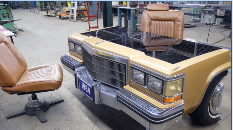
CADILLAC HOOD DESK