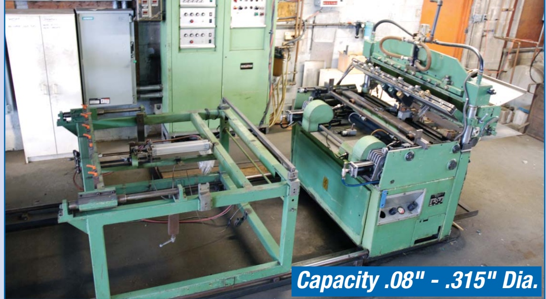
SCHLATTER MODEL PG 12-6-28. WIRE MESH WELDING MACHINE