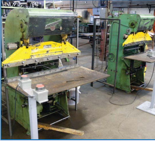
VIEW OF 2 DIACRO 4' X 18 TON PRESS BRAKES