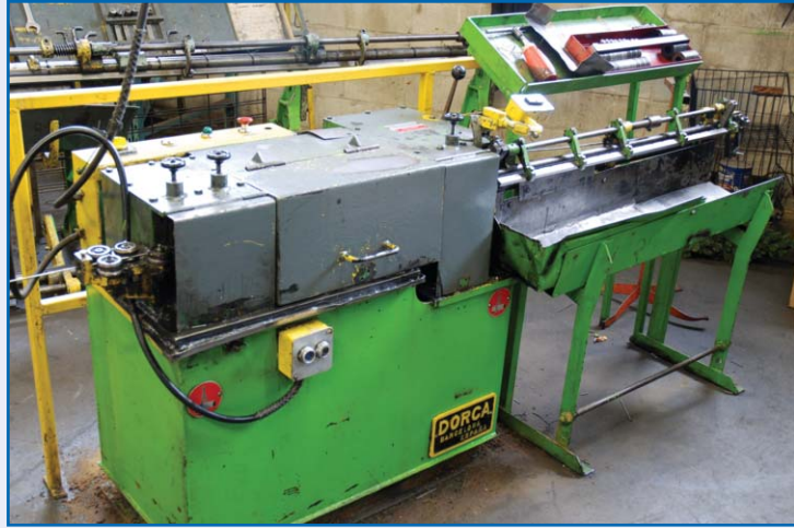
DORCA WIRE STRAIGHTENER, MODEL ECA