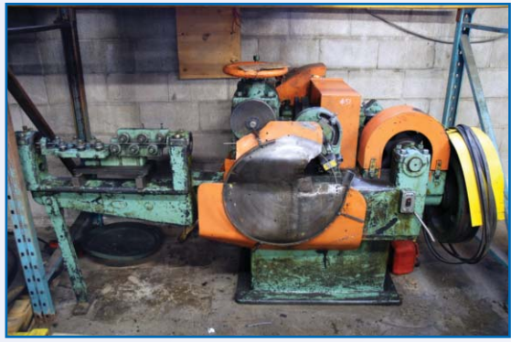
RING ROLLING MACHINE #5