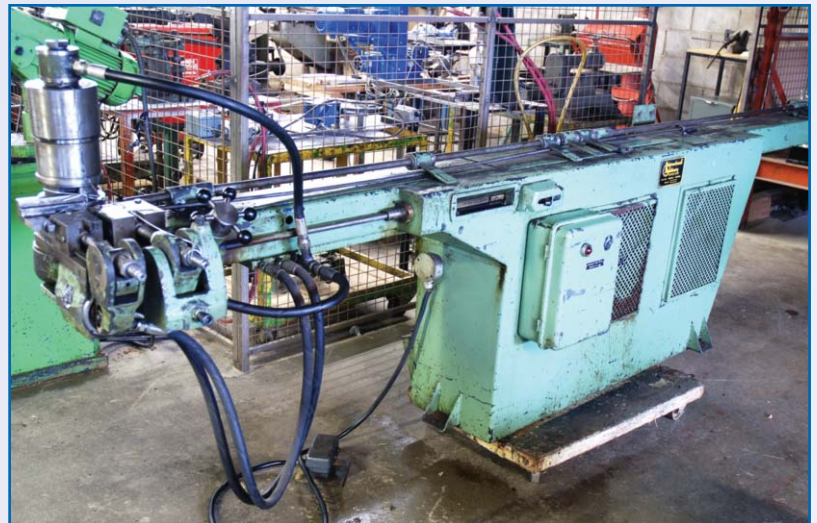
CURVATUBI AUTOMATIC TUBE BENDING MACHINE MODEL B/24