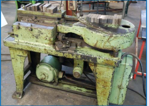
REED ROLL THREADER