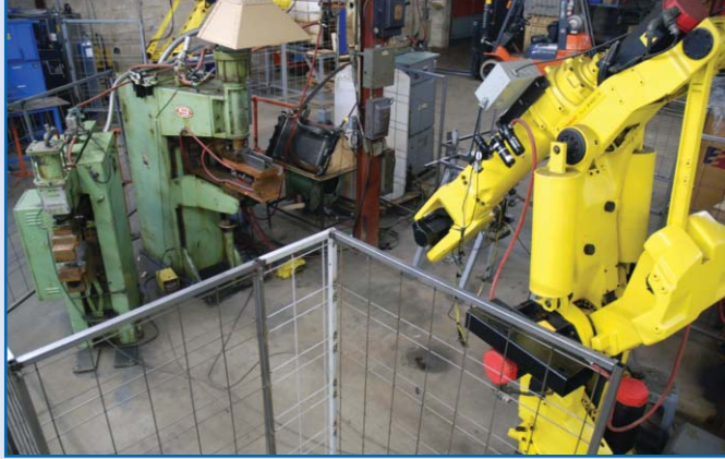
GMF S-400 6 AXIS ROBOTIC CELL. INCLUDING: BLOW FANUC S-420IF 6 AXIS ROBOTIC CELL. INCLUDING: PEER 100 KVA SPOT WELDER, BRITISH FEDERAL 75 KVA SPOT WELDER (#2)