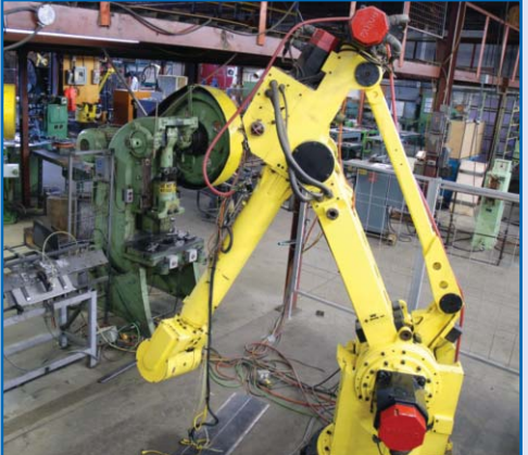
#4 OBI PRESS, & 3' PNEUMATIC METAL FEEDER (#9)