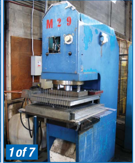
HYDRAULIC C FRAME PRESS, 70 TON