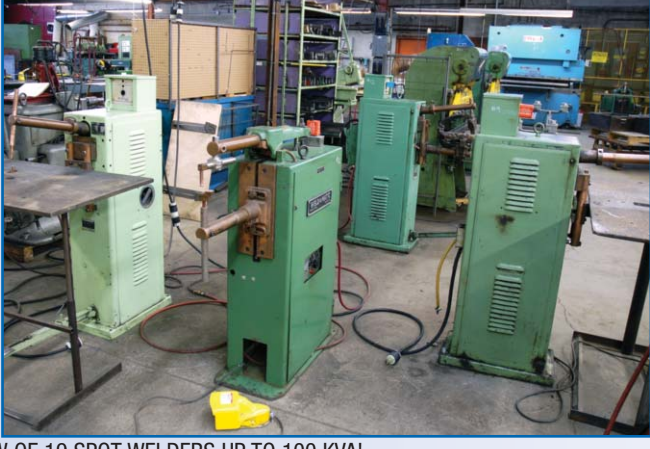
PARTIAL VIEW OF 19 SPOT WELDERS UP TO 100 KVA!