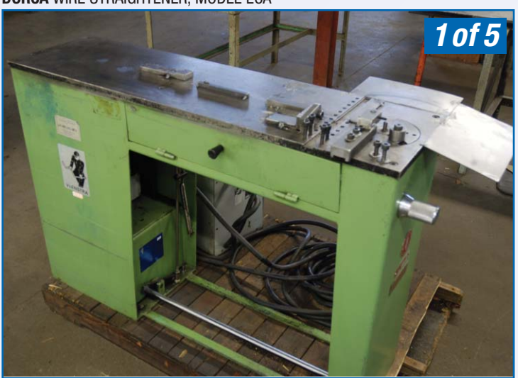
VEENSTRA PNEUMATIC BENDER MODEL FLB16