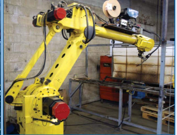
GMF S-400 6 AXIS ROBOTIC CELL, INCLUDING: COMPACOMATIC WELDER (#4)