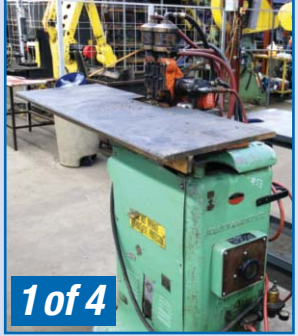
HOLDEN & HUNT MODEL NO 3 DUAL HEAD 30 KVA BUTT WELDER