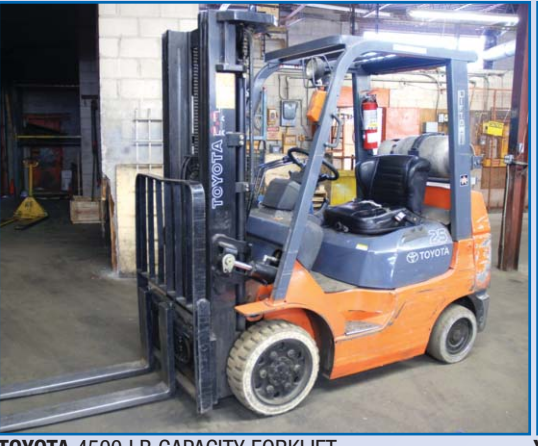
TOYOTA 4500 LB CAPACITY FORKLIFT