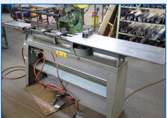
K VOGEL PNEUMATIC WIRE BENDER MODEL UB1