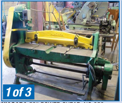
NIAGARA 52" POWER SHEAR, NO 253