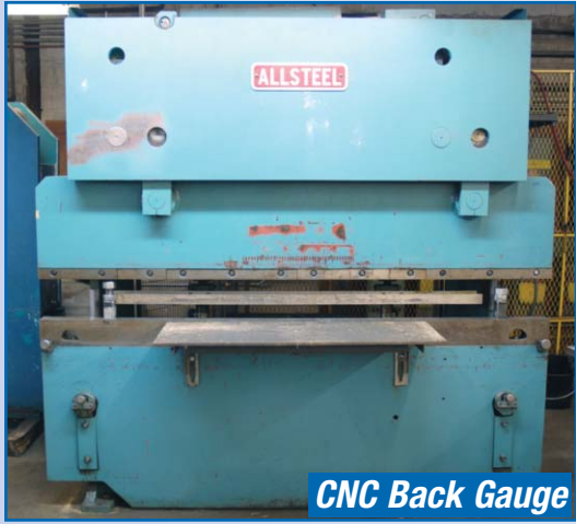
ALLSTEEL 8' X 70 TON PRESS BRAKE