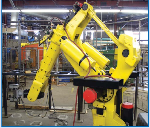
FANUC S-420iF 6 AXIS ROBOTIC CELL, INCLUDING: PRECISION GMF S-400 6 AXIS ROBOTIC CELL, INCLUDING: MEDAR DIGITAL 100 KVA & PEER 50 KVA SPOT WELDERS (#1)