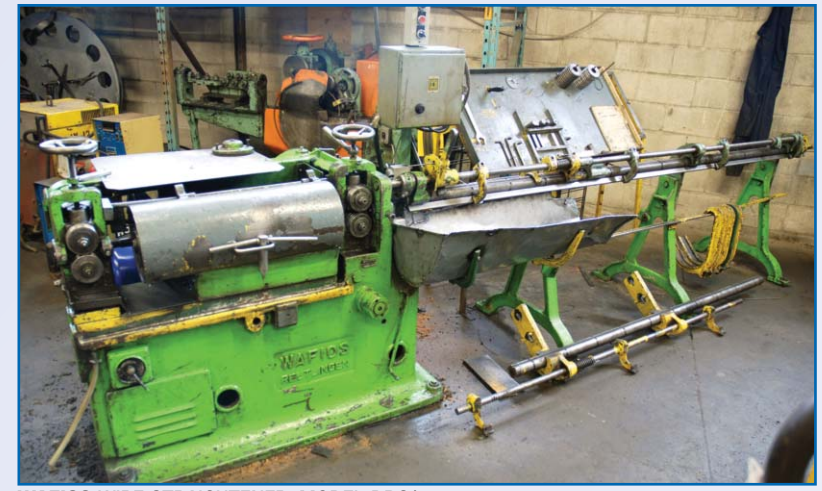
WAFIOS WIRE STRAIGHTENER, MODEL DRC/30